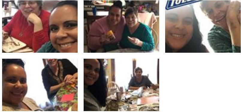
rosemarie rodriguez - February 23, 2024 at 11:45 AM

“ I will miss our chats our fun times crafting when i shld have been at work. Those days we Wld order chines take out and john bringing us breakfast Truly an angel with wings